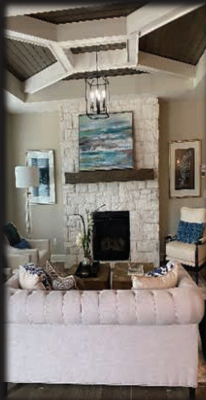
Hackett - Chalk