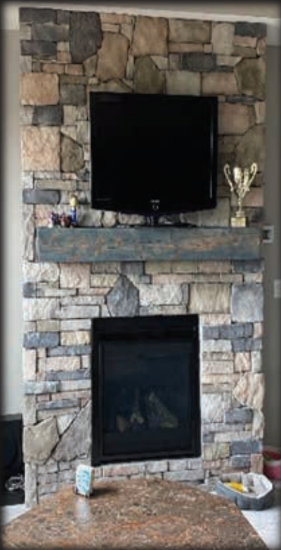
KC Blend - Cherokee