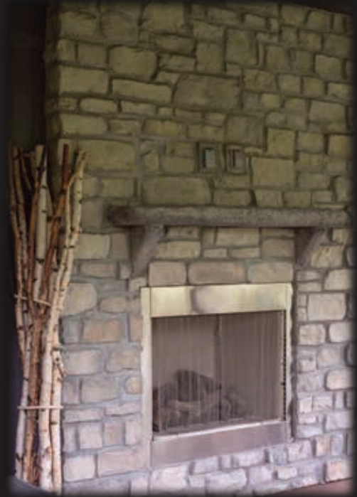
Euro Cobble - Light Ozark