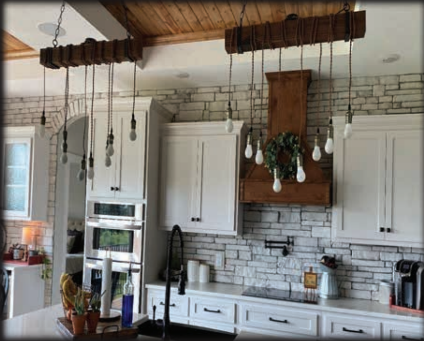
Stack Stone - Chalk